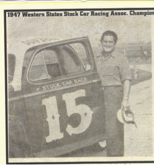
1947 Western States Stock Car Racing Assoc. Champion